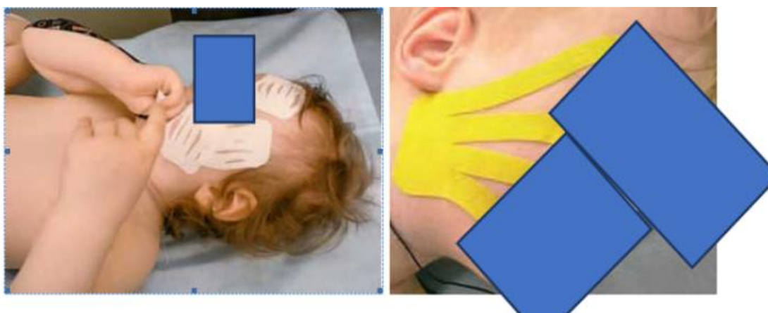
Fig. 2. Technique for applying tape: A) “Basket” type, tension up to 40%; B) For lymphatic drainage, tension 5-15%