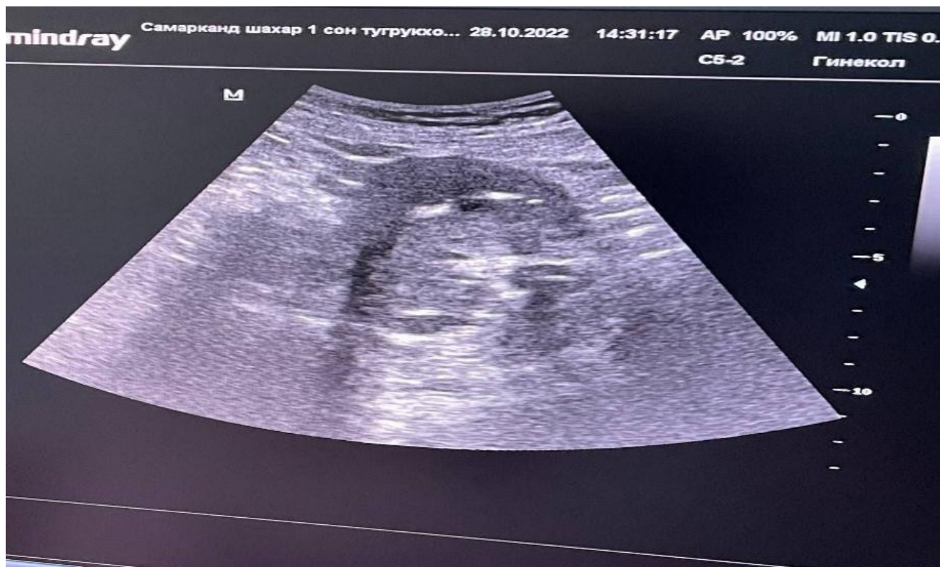
Fig. 1. The state of the receptive endometrium in patient A., 28 years old, control group

This ultrasound appearance is in good agreement with the emerging notion that the implanting embryo is rapidly and actively encapsulated by migrating decidual cells 64 . It remains to be seen whether the absence of decidual protrusion or encapsulation found on ultrasound can serve as an indirect marker of inadequate decidualization, and thus predict subsequent pregnancy loss.