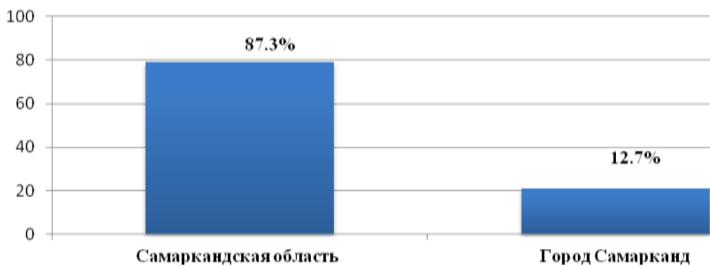
Fig. 2. Distribution of patients by place of residence