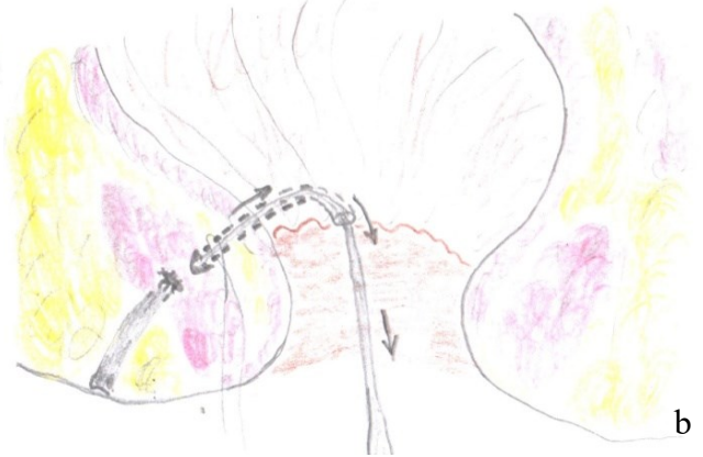
Fig. 2. Transsphincteric fistula of the rectum (deep portion of the sphincter): a. - a probe was passed through the fistula passage. A part of the fistula in the intersphincter space is isolated from tissues, a dissector is carried out under the fistula passage and removed from the opposite side; b. - the fistula passage is ligated near the external sphincter; c. - pulling the proximal part of the fistula passage into the lumen of the rectum into exile, at the very base the fistula is bandaged and cut off.