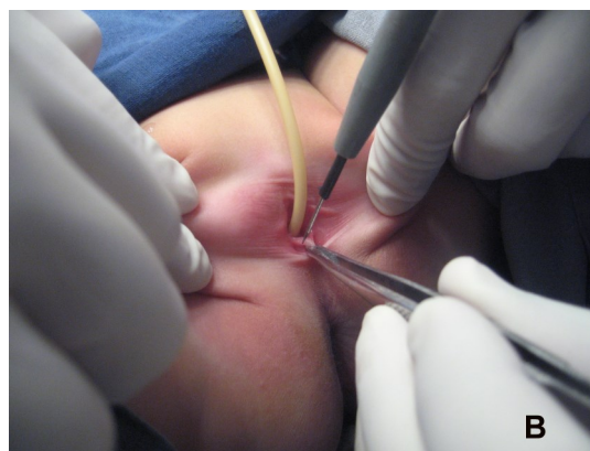
Fig. 2. Schematic (A) representation (dotted line) of the course of incision on hymenal tissue to preserve the hymenal ring and during surgery (B).